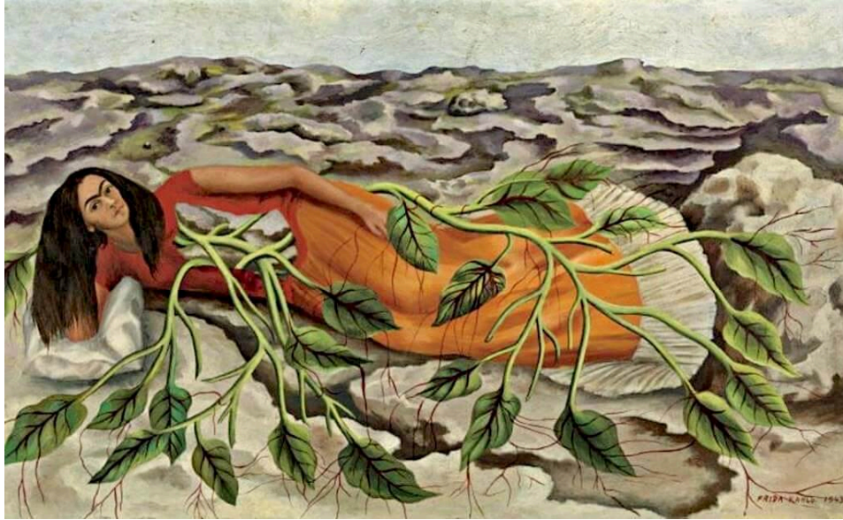
"Roots" by Frida Kahlo fridakahlo.org/roots.jsp