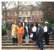
Bmore Youth Arts Advocacy Council Visits Annapolis!