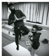
Arts Provider Spotlight: Creative Nomads