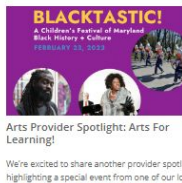
Arts Provider Spotlight: Arts For Learning!