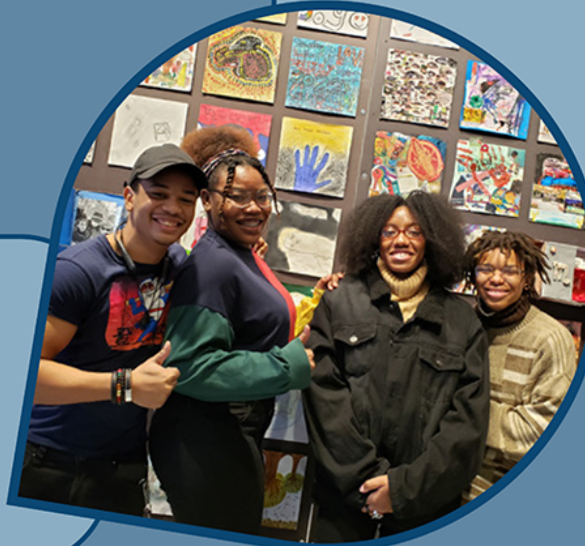
10X10 Art Exhibit Youth Curatorial Team for 2022.

25 hours worked by the 2022 10x10 Youth Curatorial Team