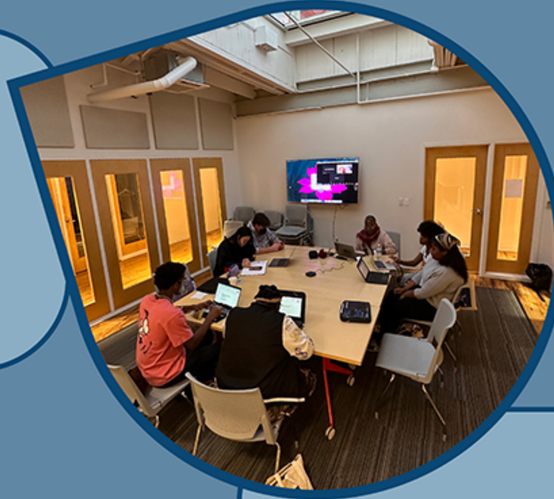
BYAAC Team Meeting researching policy on Art Education

912 hours worked by the Baltimore Youth Arts Advocacy Council