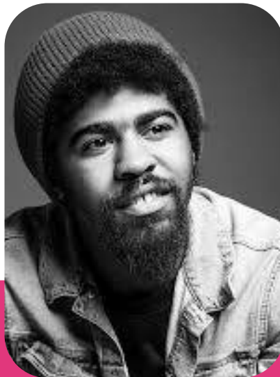
Devin Allen, Photographer and Activist