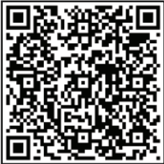
Day One Sessions

Please be sure to use the surveys below to reflect on the sessions you attend during this conference. This feedback helps us to continue improving our conference offerings to best meet the needs of teachers and attendees.